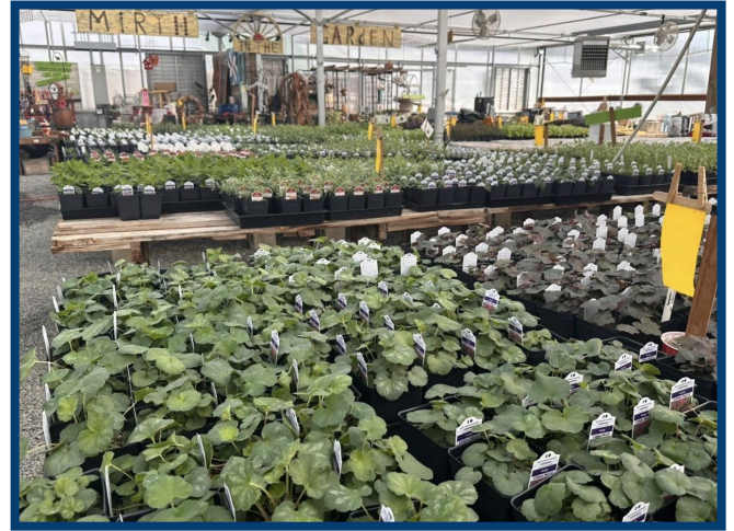
An abundance of Heuchera plants!