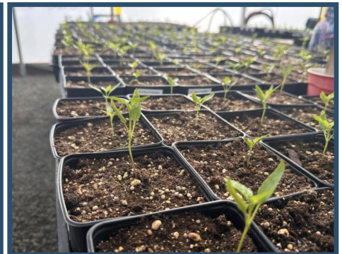
Pepper seedlings have grown a lot in just one week.

Arts: Such a talented and devoted crew puts out great work.