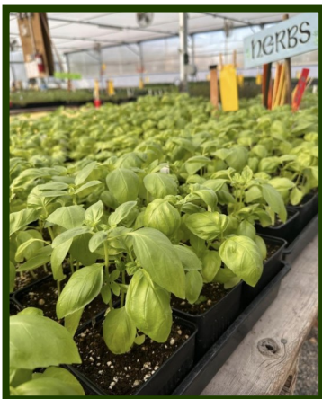
A sea of basil. Mmmm...can you smell it??