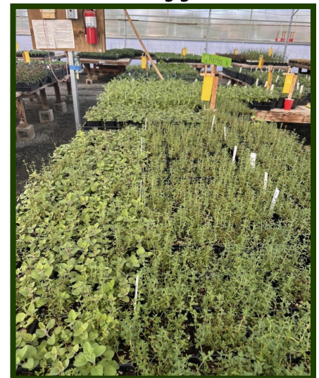
Oregano or Thyme, anyone?