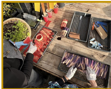
Sorting the colored sticks for plant pricing.